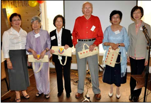
A souvenir bag is presented to our beloved teachers.